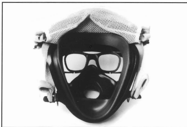
AV-2000 Facepiece with Lens Mounting Assembly Properly Installed