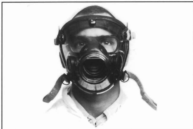
Front View of Lens Mounting Assembly Installed in AV-2000 Facepiece

UNDER NO CIRCUMSTANCES SHOULD THE RESPIRATOR BE USED IF A GOOD FIT BETWEEN FACEPIECE AND FACE CANNOT BE ACHIEVED.